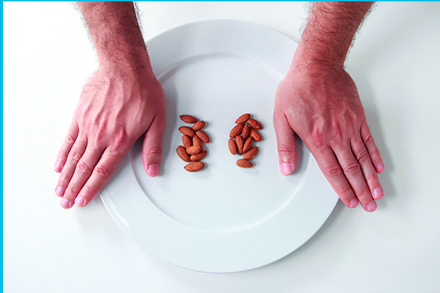
2 entire thumbs of fat dense foods with most meals

Note: Your hand size is related to your body size, making it an excellent portable and personalized way to measure and track food intake.